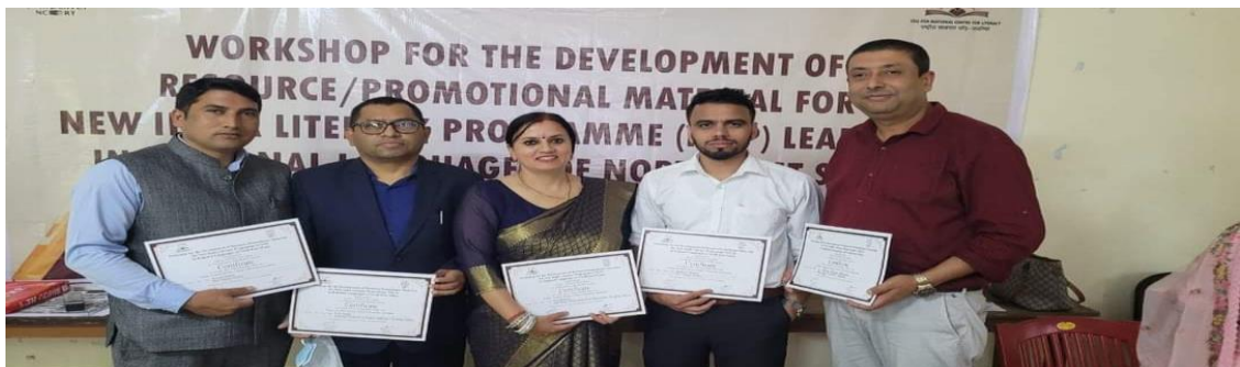
NILP WORKSHOP IN GUWAHATI