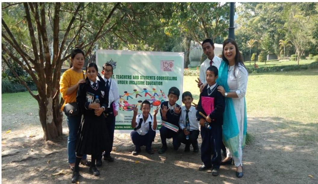
Counselling Under Inclusive Education