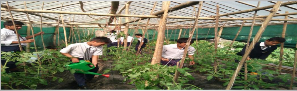
Students watering tomatoes in poly house [north]