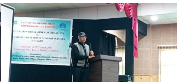
Training of Librarians