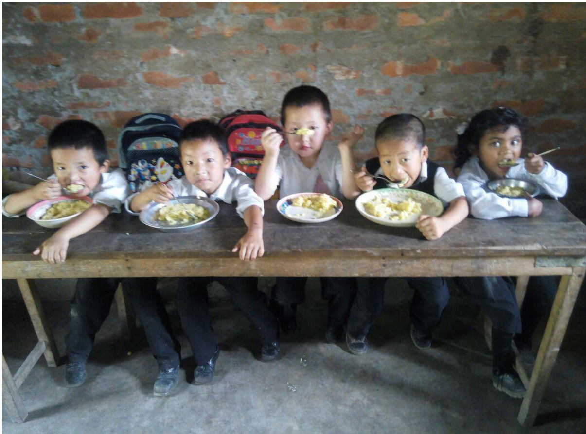
Children collecting organic vegetables from the school garden