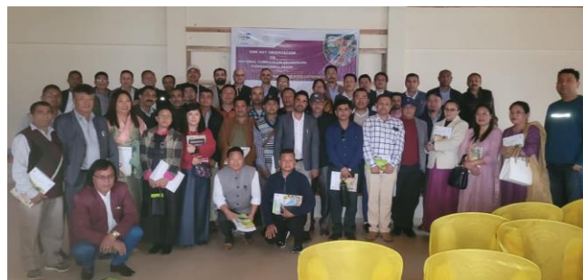
Orientation on NCF-FS at