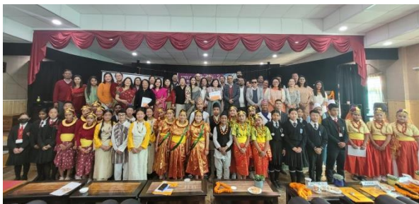
Role Play Folk Dance Competition