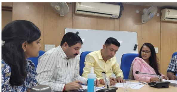
NILP workshop at CNCL-NCERT New Delhi Pakyong