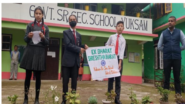
Speech on Delhi in morning assembly of Delhi