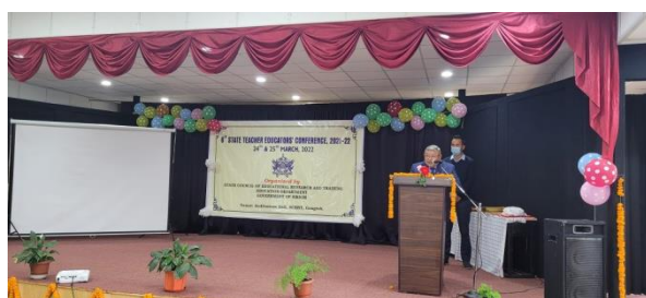
State Teacher Educator Conference 2022