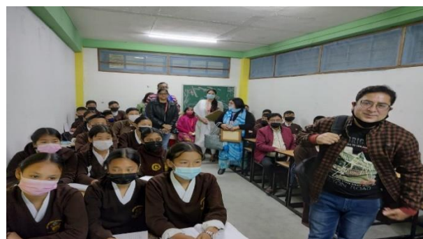
School visit in Sikkim by the teachers