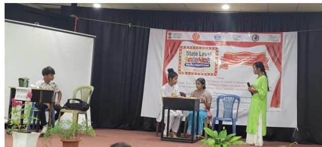
State Level Science Drama